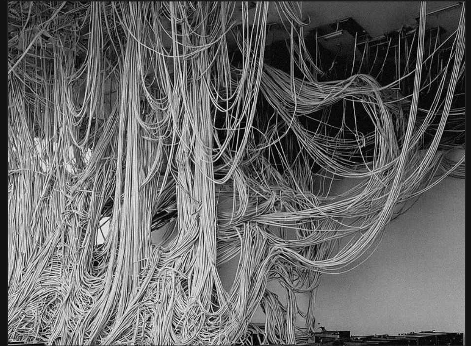
Custom screen environment at Nebula.

Enterprise access, tokens, beta test access, and more — perks bundled for participating designers